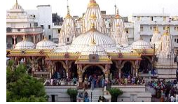
Swami Narayan Temple