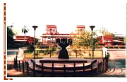
Sardar Patel Memorial